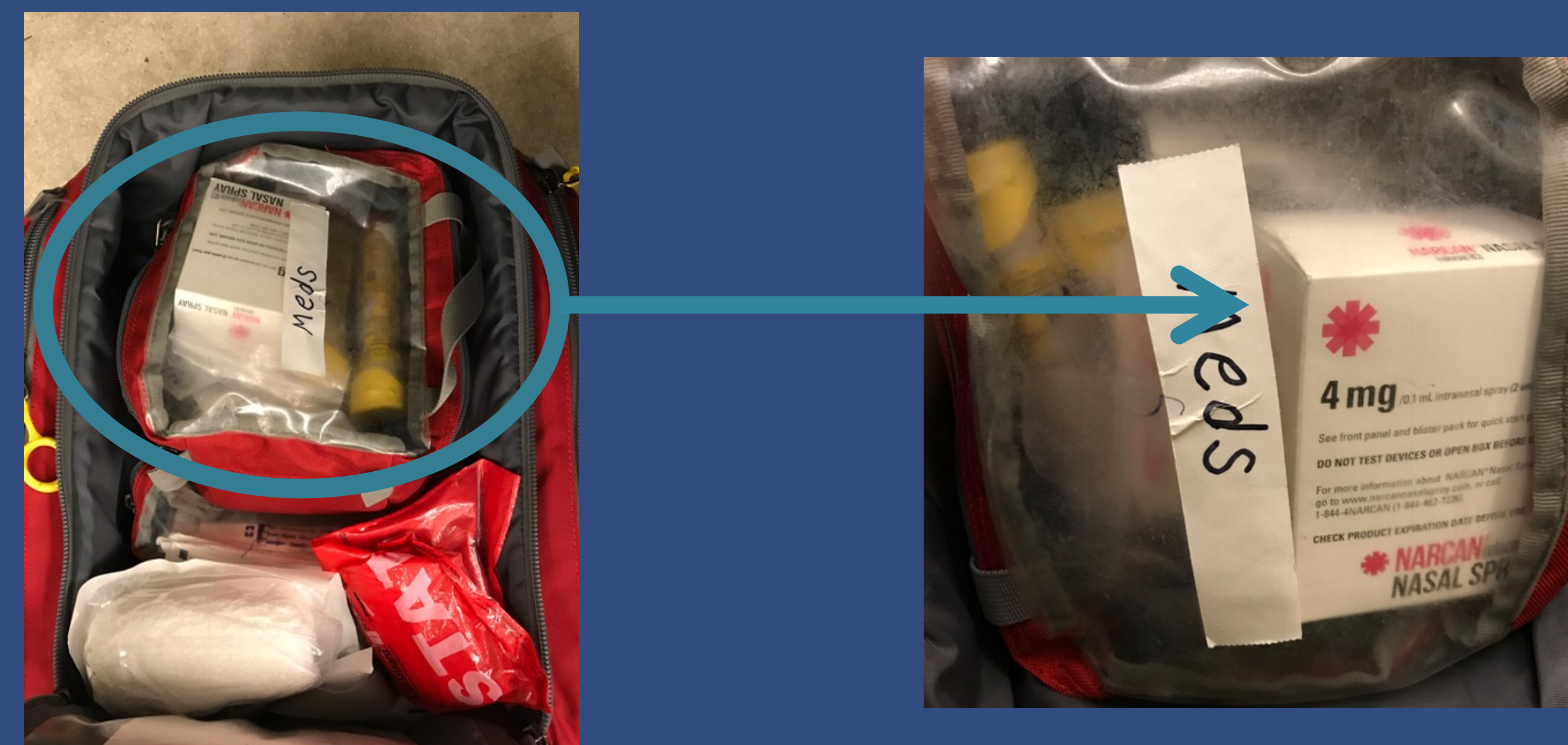
Intranasal Narcan (4mg – two doses) in the First Aid bag