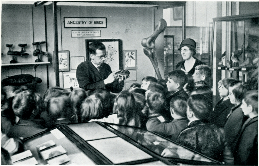
DEMONSTRATION IN NATURAL HISTORY GALLERY TO PUPILS OF ORMEAU ROAD PUBLIC ELEMENTARY SCHOOL.