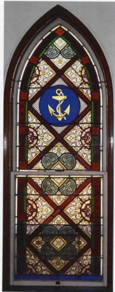
The Anchor Cross

The unity of design of the church's Gothic Revival architecture is reflected in the eight lancet stained glass windows in the sanctuary. Four of the windows are with foliage patterns only. The other four windows have distinctive Christian emblems in round colored circles called "roundels". Each one measures 90 inches by 30 inches, perhaps in homage to sacred geometry.