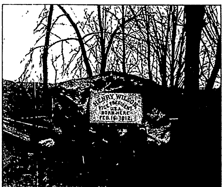
BIRTHPLACE OF VICE PRESIDENT WILSON