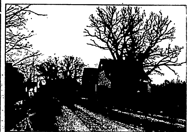
CENTRAL STREET LOOKING EAST.

and situated on the corner of Main and Pleasant streets, in Farmington, N. H. The building was erected and dedicated in the year 1876. The church was built on the site of the old church which had been erected and dedicated in the year 1810. The church was built on the site of the old church which had been erected and dedicated in the year 1810. The church was built on the site of the old church which had been erected and dedicated in the year 1810.