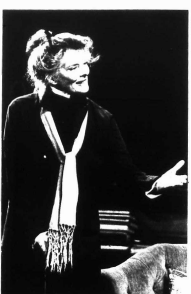
Katharine Hepburn is brilliant portraying Margaret Mary Elderice in The Waltz .

The three new Waltz films are a perfect example of the old adage: "The more, the merrier." The new Waltz films are a perfect example of the old adage: "The more, the merrier."