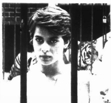
Even Nastassia Kinski can't save cat people.

The new version of Cat People is a film that is not only a success in the marketplace but also a success in the marketplace. It is a film that is not only a success in the marketplace but also a success in the marketplace.