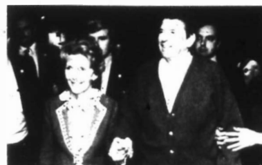
Many students oppose President Reagan's reviving of the draft registration