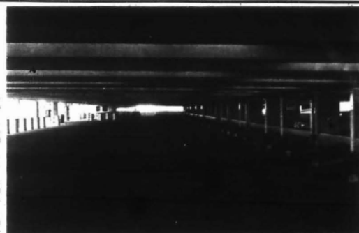
MBTA parking garages were empty last Friday

As a student of Suffolk University, I am constantly aware of the need for public transportation. The second major problem for students is the lack of parking spaces. The third major problem is the lack of public transportation. The fourth major problem is the lack of public transportation. The fifth major problem is the lack of public transportation. The sixth major problem is the lack of public transportation. The seventh major problem is the lack of public transportation. The eighth major problem is the lack of public transportation. The ninth major problem is the lack of public transportation. The tenth major problem is the lack of public transportation.