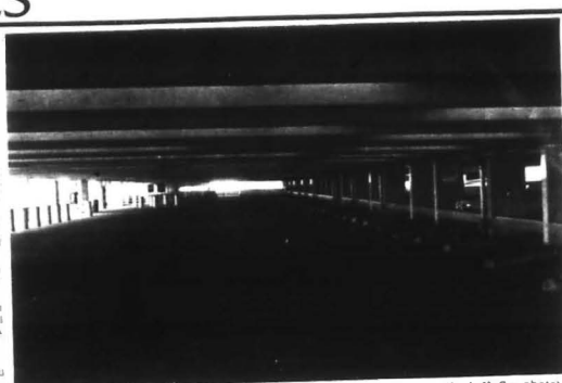
MBTA parking garages were empty last Friday

Suffolk administration has failed to make any effort to solve the problem. The school administration has failed to make any effort to solve the problem. The school administration has failed to make any effort to solve the problem.