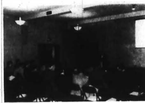
ATTENTIVE SUFFOLK BUSINESS CLUB students listen to lecture at Esso Standard Oil Co. in Everett during recent field trip to that spot.