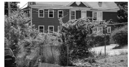
Before (top) and after photos show one of the Lowell neighborhoods that police officers focused on as part of their problem-solving efforts. Trash was cleaned up, and the neighborhood saw a reduction of crime with no significant increase in crime in the surrounding neighborhoods.