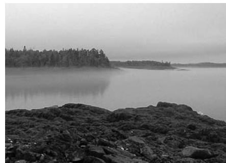
Outer Birch Island, one of five study areas in the Cobscook Bay region.

NEERS is a 500-member organization of coastal research scientists and students from New England and Atlantic Canada. Its 2007 meeting was co-hosted by the Bigelow Laboratory for Ocean Sciences and the Maine Department of Marine Resources. ▶