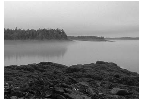
Outer Birch Island, one of five study areas in the Cobscook Bay region.

NEERS is a 500-member organization of coastal research scientists and students from New England and Atlantic Canada. Its 2007 meeting was co-hosted by the Bigelow Laboratory for Ocean Sciences and the Maine Department of Marine Resources.