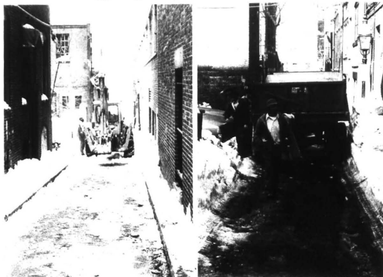
Nadar and Bond question Reagan's policies