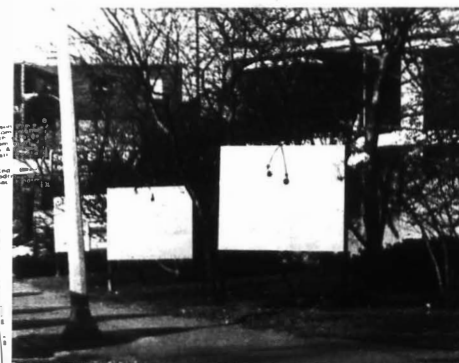
There's no doubt that living in Boston is convenient, but it is also very expensive.