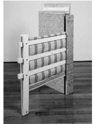
Isabel Riley, Construction in Yellow (2009), wood, fabric, paint.

Widely ranging materials and techniques define the sculpture of these five Boston sculptors. The means vary from reproductions of recognizable objects to abstract, expressive assemblages or hybrids of the two. The media employed span the spectrum from actual trash to 24K gold.