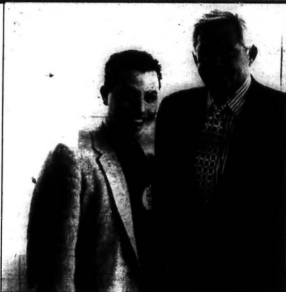
Students react to recent tuition hike