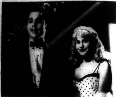
Johnny Depp and Patricia Arquette star in "Ed Wood", about the prolific B-movie producer of the mid-1950s. Directed by Tim Burton, from Touchstone Pictures