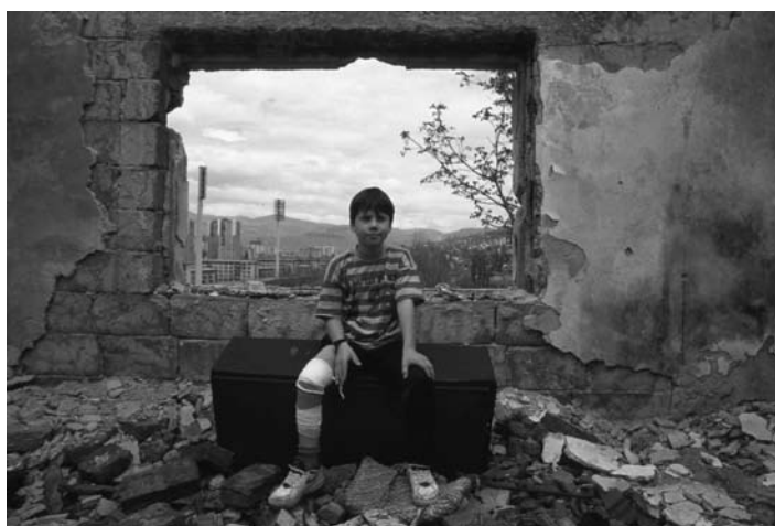
Antipersonnel mine victim, Sarajevo, Bosnia-Herzegovina 1997