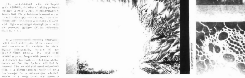
A VISUAL DISPLAY of the Museum of Science's new exhibition, MicroVISION