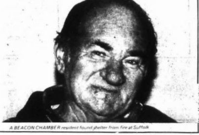
A BEACON CHAMBER resident found shelter from fire at Suffolk