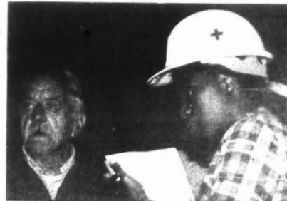
RED CROSS WORKER registers guest in Fenton building after hotel blaze