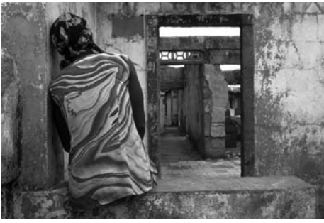
Sierra Leone, 2001