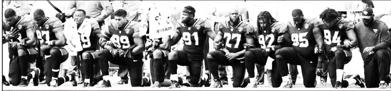
By Twitter user @proviewusa