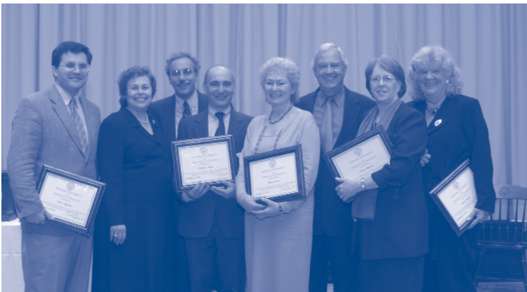
Employees from the Sawyer School of Management.