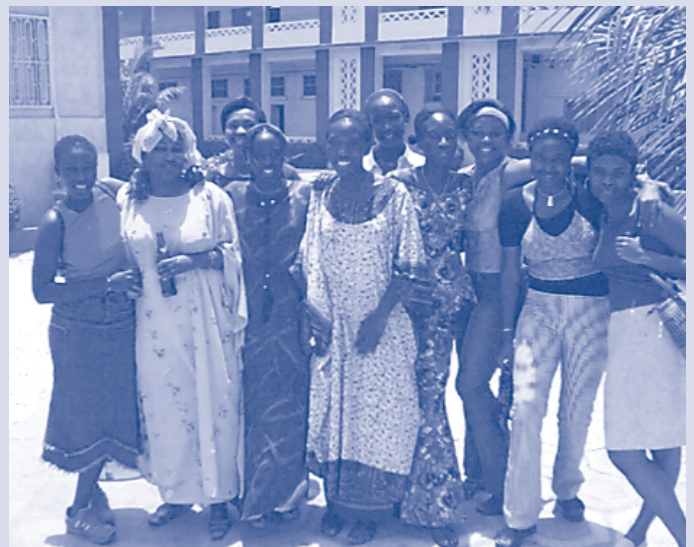
Students in Dakar, Senegal.

"I'm looking forward to working at Suffolk's Senegal campus," he said. "The students have few opportunities over there, so it feels good to be in the position of helping them to change their lives." •