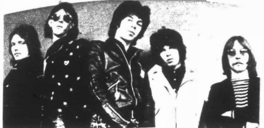
BOSTON'S OWN CARS stall in their third release, 'Panoptima'