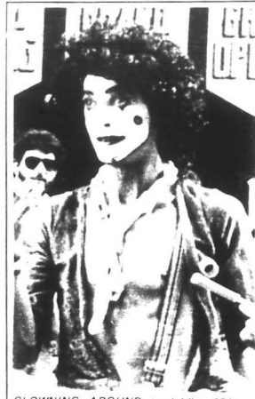
CLOWNING AROUND in Jubilee 350

However, both times the two point conversion failed, the last one failing with just 14 seconds left in the game. The final score Raiders 16 White Heat 14.