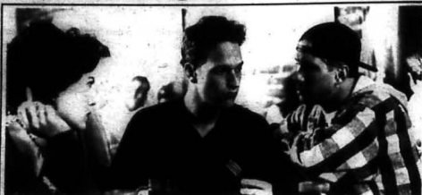
Management at trolis Lara Flynn Boyle, Josh Charles, and Stephen Baldwin star in "Threesome."

Everything is fine and dandy until the new roommate arrives and the he they were expecting turns out to