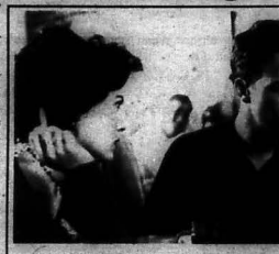
Manago et trolis Lara Flynn Boyle, Josh Charles

Everything is fine and dandy until the new roommate arrives and he they were expecting turns out to