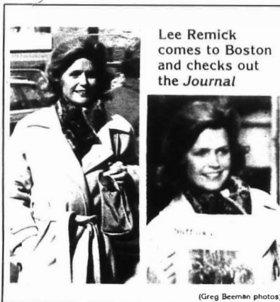
Lee Remick comes to Boston and checks out the Journal