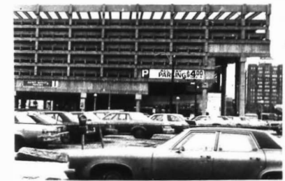
Kinney Garage at Haymarket