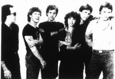
Quarterflash has an extensive East coast tour planned for late May with Lover Boy.