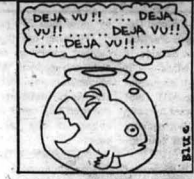
GOLDFISH ARE NEVER BORED.