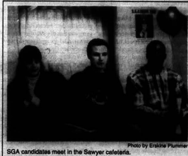
SGA candidates meet in the Sawyer cafeteria.

The next edition of the Journal will be published on Wednesday, March 29. Have a good break!