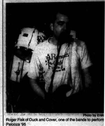
of Duck and Cover, one of the bands to perform at Palooza '95

Suffolk Palooza '95 was a definitive night of talent, music and charity and with luck the tradition will continue.