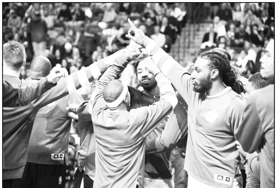
By Twitter user @celtics

With that being said, this post-season will not be a total failure regardless