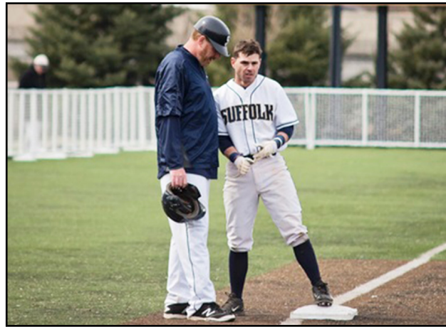
(Left) Head softball coach congratulates student-athlete. (Above) Head baseball coach discuss game plan with a player.