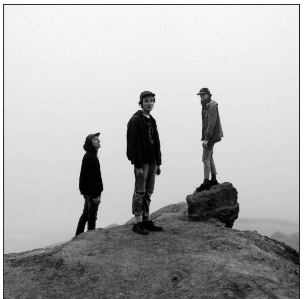
By Twitter user @Vundabar_band

Yet, their voice goes beyond just inspiring their audiences, they also enact a high level of pure and raw fun. This may come from their sound, or even their rich sense of humor. Just from watching their live performances, their energy can be felt vibrating through their words and instruments. In their YouTube videos, their humor and rambunctious nature exude jubilating