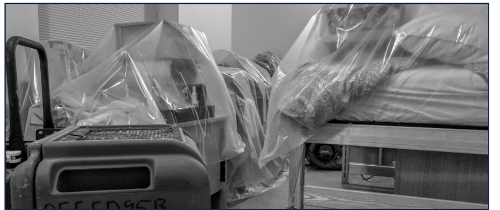
Room 313 in 10 West.