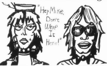
by Laurie Fainblatt

It's a stressed-out bride, a groom who's a punk, and a wedding that's anything but traditional.