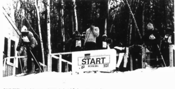
COME HACE with Y.E.S. youngsters because the Y.E.S. is your own program.