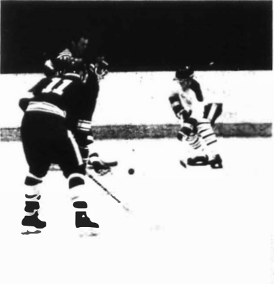
SUFFOLK takes to the ice for their 1st season in varsity hockey.

Home games played at Walter Brown Arena Boston University 255 Babcock St. Boston