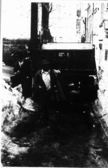
WINTER IS ON ITS WAY and with it comes snow, trucks, and hazardous pass on Rte. 1A